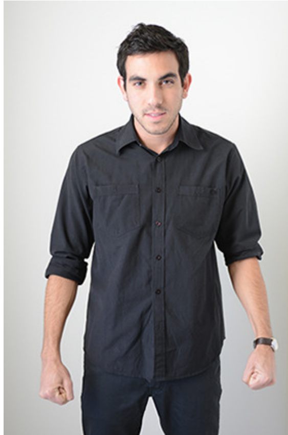
An Attack Stance