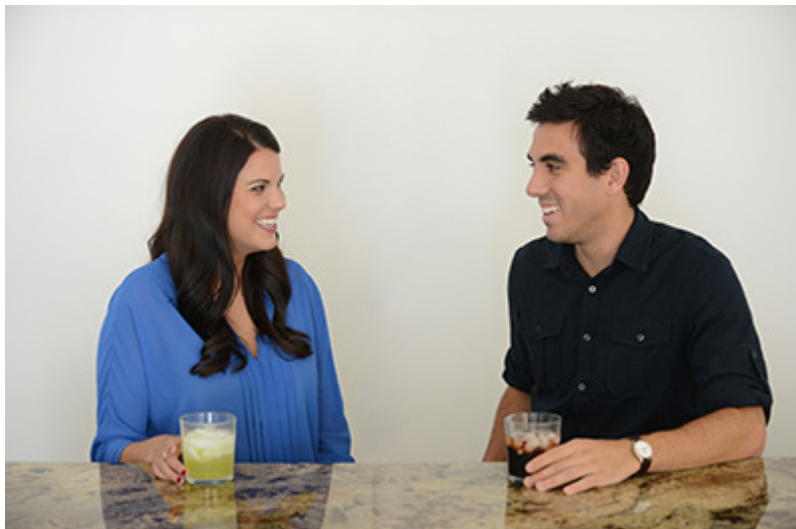
Torso repositioning sequence