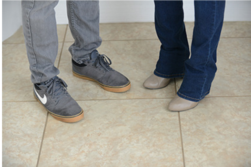
Feet askew invites other people to join the conversation.

When three people face each other and their feet are pointed inward forming a closed circle, they are nonverbally communicating an unwillingness to accept new members.