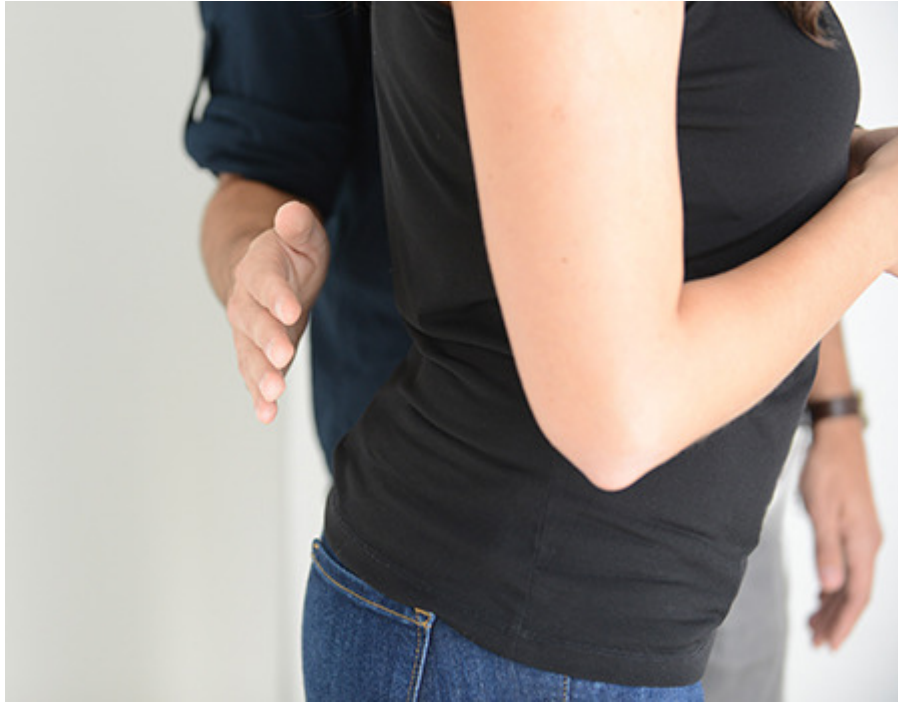
Staking a claim, but not a sexual touch.