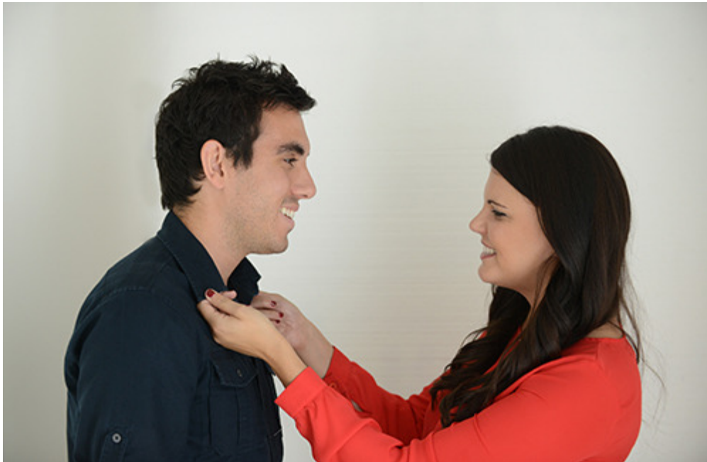
Getting “groomed” is a sign of good rapport.