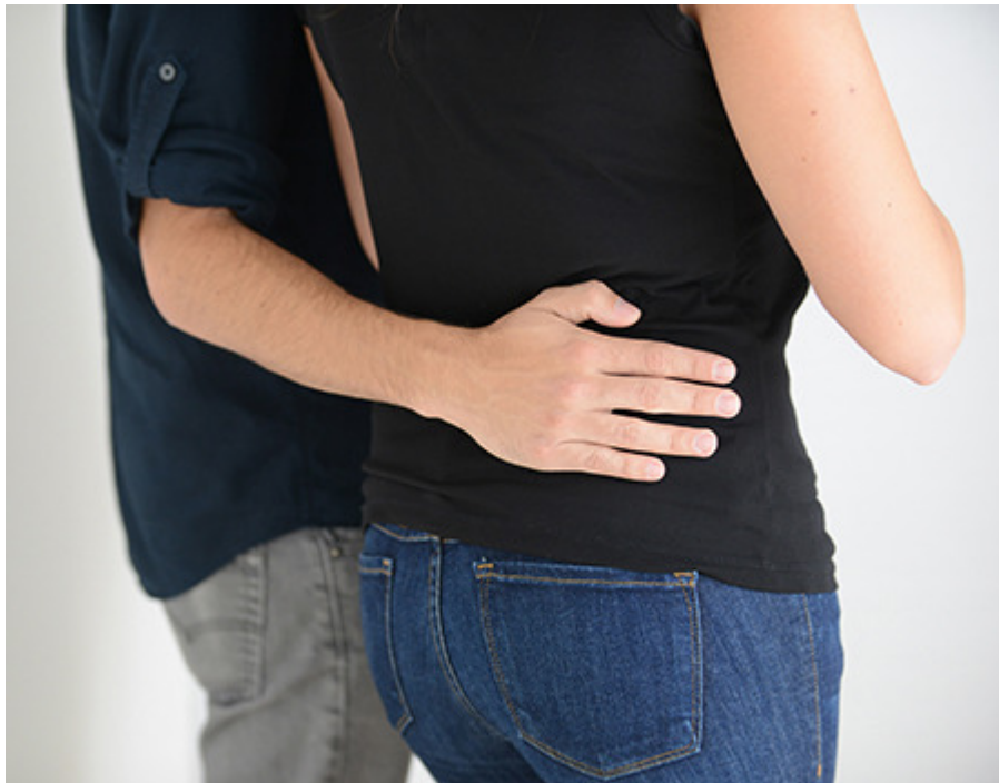
An intimate touch.

If a man attempts to prematurely touch the small of a woman's back, she will often flinch and show nonverbal signs of discomfort, or a combination thereof. On the other hand, if, as you approach, the man firmly touches the small of the woman's lower back or hip region, you should assume that the relationship has progressed well beyond the introductory stage and you should look elsewhere for companionship.