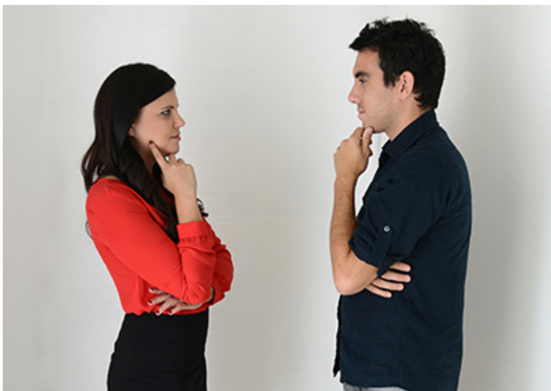
Isopraxism (mirroring) gestures

However, the absence of mirroring is a foe signal and the brain will take notice when two people are out of synchrony during personal interactions. The person not being mirrored may not be able to specifically articulate why they are uncomfortable, but this foe signal will trigger a defensive response, which discourages attempts at friendship.