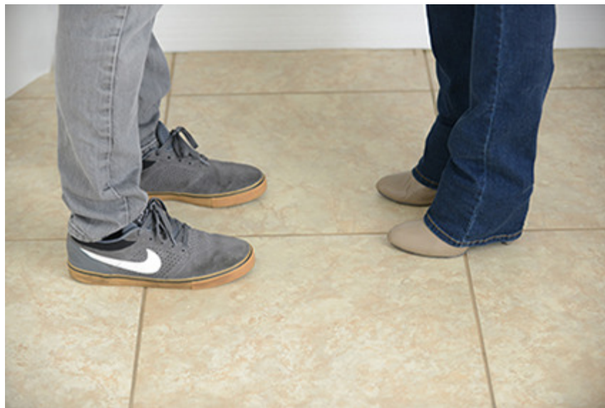
Feet telegraphing a private conversation.

If you see two people who are facing each other—each with their feet pointing toward the other person—they are telegraphing the message that their conversation is private. Stay away. They do not want outsiders to interrupt. On the other hand, if two people are facing each other with their feet askew, this leaves an “opening” and sends the message that they are willing to admit a new person to their group.