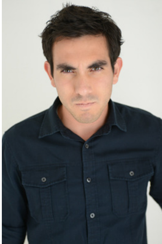
An urban scowl.

Would you want to approach the person who is pictured wearing an urban scowl? Keep in mind that many people who exhibit this expression are totally unaware they are displaying foe signals that discourage others from interacting with them. That is why an understanding of what constitutes appropriate verbal and nonverbal friend signals is so critical.