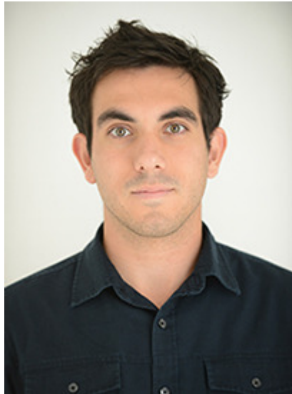
Unnatural Eyebrow Flash

A head tilt is a strong friend signal. People who tilt their heads when they interact with others are seen as more trustworthy and more attractive. Women see men who approach them with their head slightly canted to one side or the other as more handsome. Likewise, men see women who tilt their heads as more attractive. Furthermore, people who tilt their heads toward the person they are talking with are seen as more friendly, kind, and honest as compared with individuals whose heads remain upright when they talk.