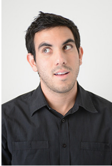
An eye roll