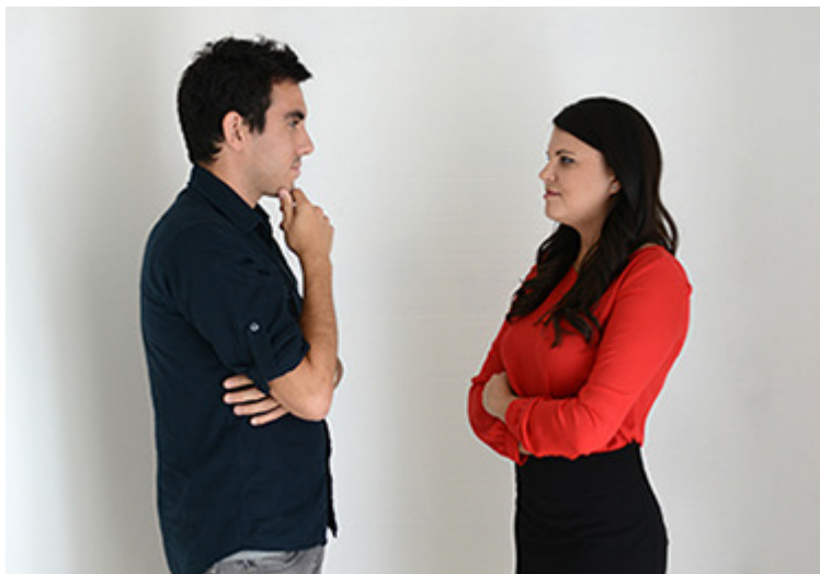
Examples of good rapport (top photo, mirroring clearly visible) and poor rapport (bottom photo, asynchronous posture and no mirroring in evidence).

People who are psychologically connected mirror one another's body gestures. Intentionally mirroring another individual's body language promotes rapport. When you first meet someone, you'll want to mirror his or her gestures to establish rapport. At some point during the conversation, you can