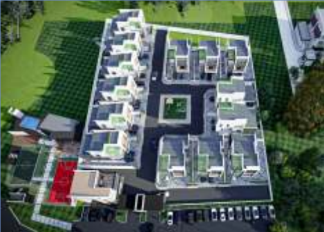
THE ECHELON VILLA