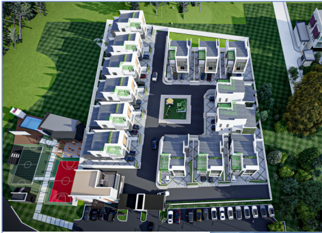
THE ECHELON VILLA